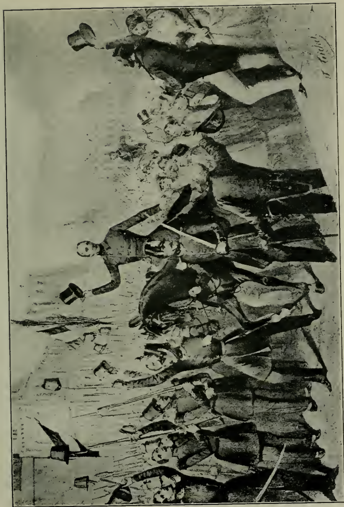
TRIUMPH OF LAMARTINE, MAY 15, 1848

From a contemporary lithograph in colors by F. Tichet